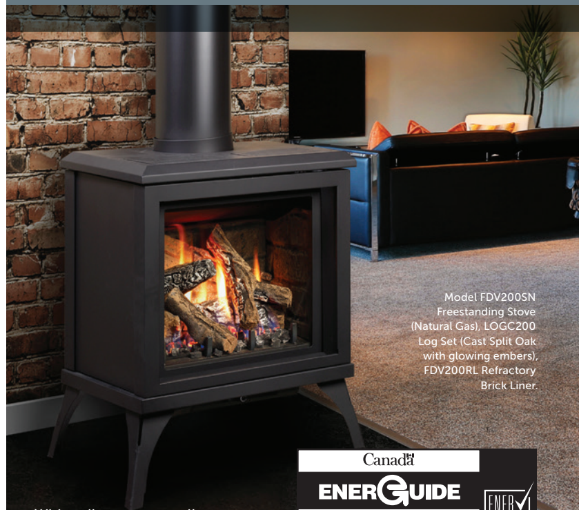
Model FDV200SN Freestanding Stove (Natural Gas), LOGC200 Log Set (Cast Split Oak with glowing embers), FDV200RL Refractory Brick Liner.